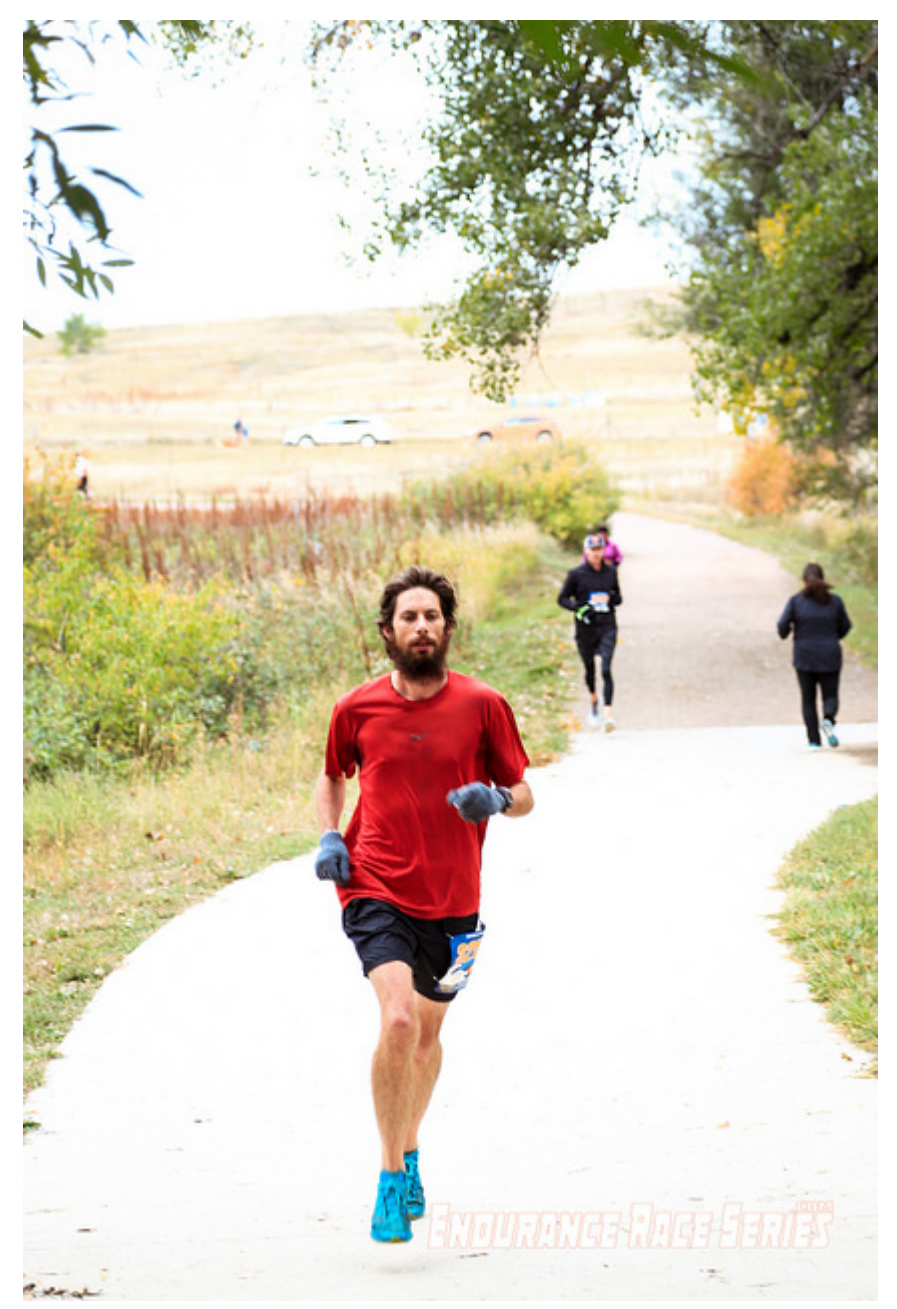
The other side of the hill