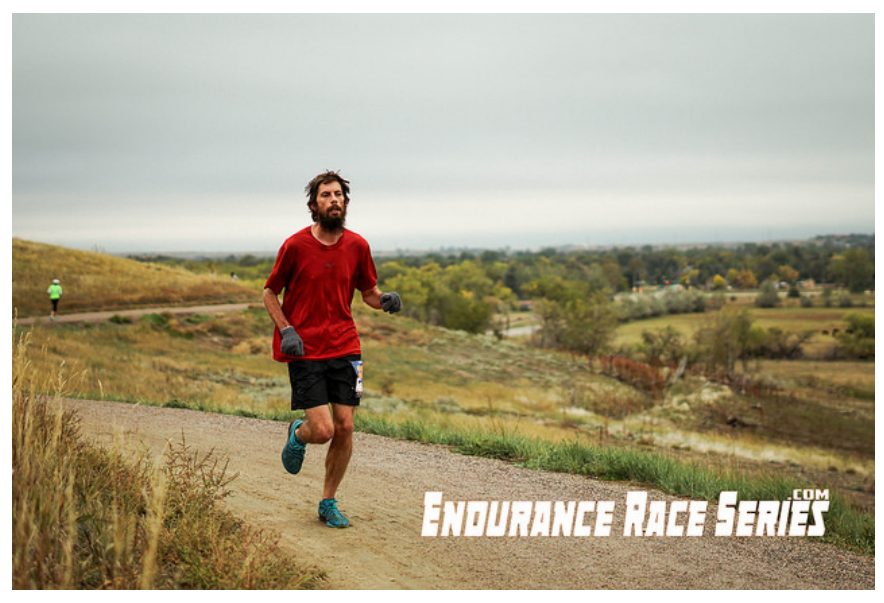
Near the top of the hill

Soon after passing the start/finish line and starting off east on the longer out-and-back segment, I heard footsteps approaching from behind. But just when I was sure I was going to be passed, we hit the hill that goes up to Aquarius Trailhead, the highest point of the course. I tried to maintain a consistent effort which meant slowing down a bit on the climb (this would be my slowest kilometer at 4:31), but apparently the runner poised to pass me slowed even more. Even after I slowed again to get some fluid at the aid station at the top of the hill he was several seconds behind.