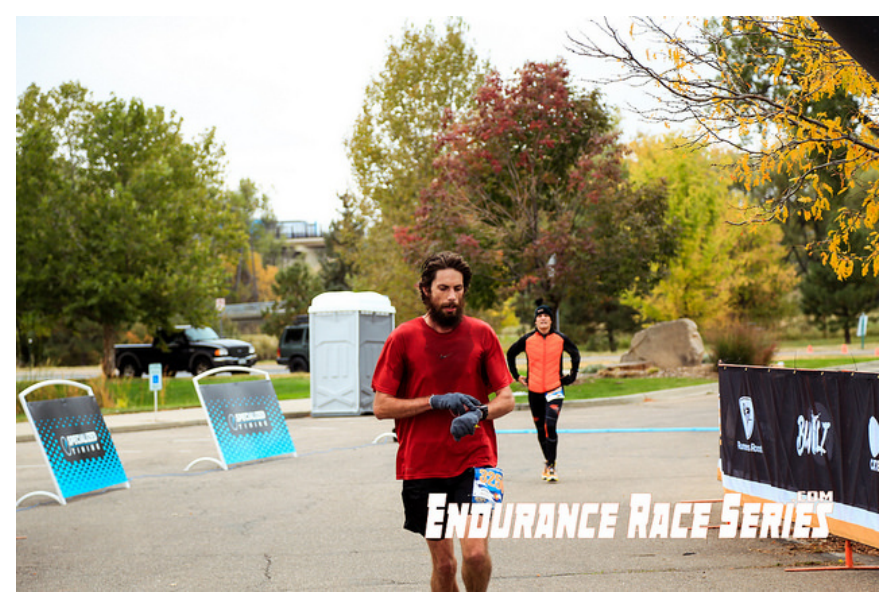
Failing to stop my watch at the finish line