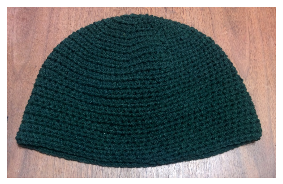
Figure 7. Completed hat

Cut the yarn leaving a few inches and pull the end through the last loop on the hook. Pull to secure. To make it more secure, weave the end under a few strands on the inside of the hat and then trim it off.