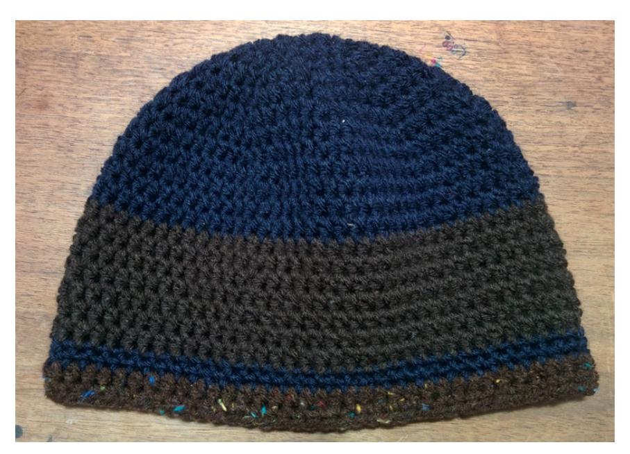
Figure 9. Hat with multiple yarn colors