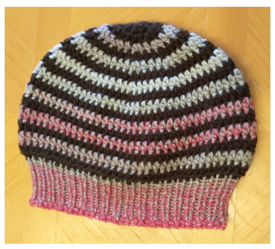
Figure 10. Striped hat with knit rib. Made with a 6mm hook, I changed between two balls of yarn every row (brown and a variegated pink/grey). I stopped the hat once it was about 6" long and picked up the stitches on 5mm 16" circular knitting needles to knit the k1p1 ribbed brim.