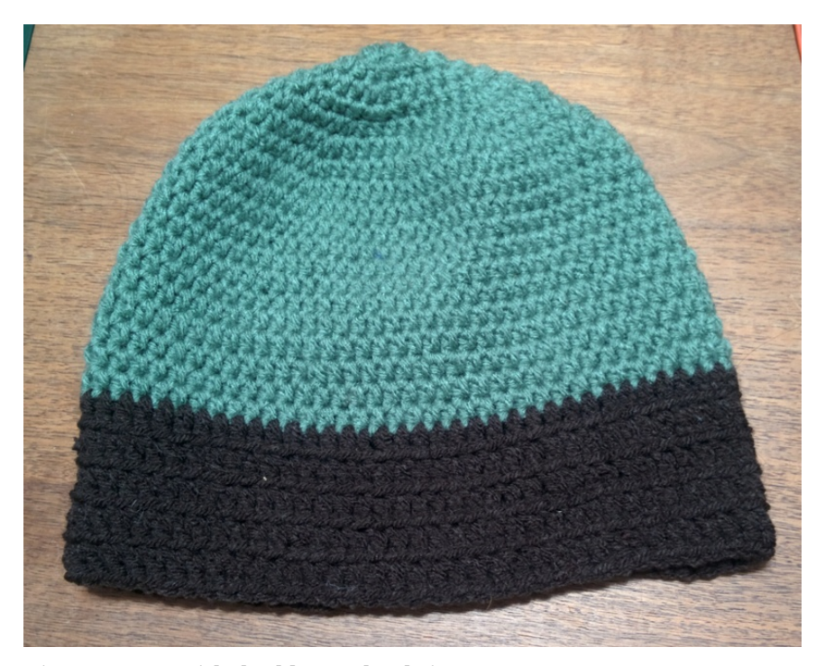
Figure 8. Hat with double crochet brim

The Warm Up America Foundation collects donated hand knit and chrochet items to distribute to people who need them.