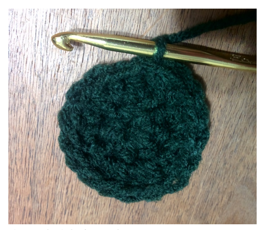
Figure 3. The circle after round 2

Don't worry, it gets easier to see what you're doing and where to make stitches after this row.