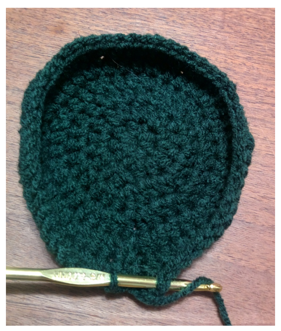
Figure 4. Ready to join after Round 6