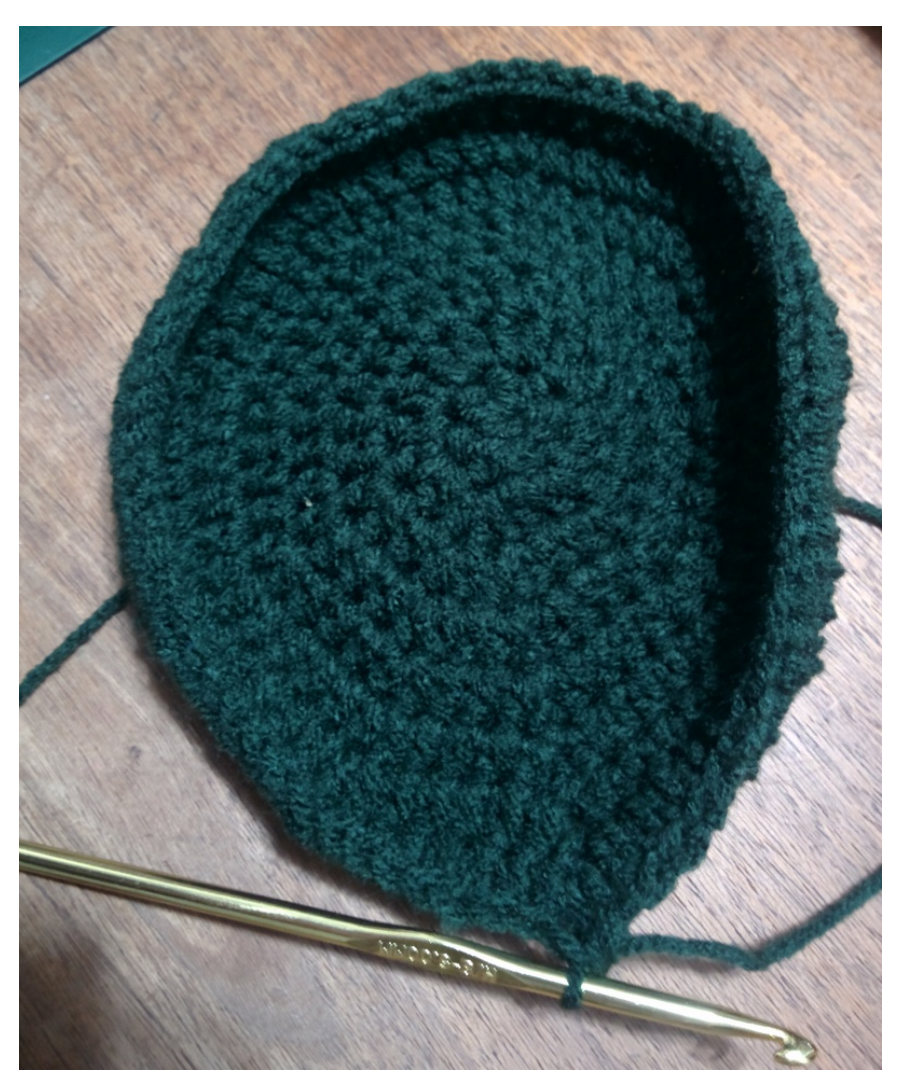
Figure 5. Row 8 is complete, and the first stitch of Row 9 (an hdc and not a chain) has been made