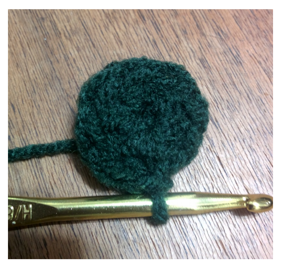
Figure 2. The first row of 8 hdc joined to the initial turning chain. This little circle will become the top of the hat.

an hdc stitch. Two chains equals the height of one half-double crochet stitch, and you will always chain 2 at the beginning of every row while increasing. So when you complete Row 1 you'll have 9 stitches on the circumference: 8 hdc + the chain. You should be able to count 9 V-shaped stitches which you will work into on the next row.