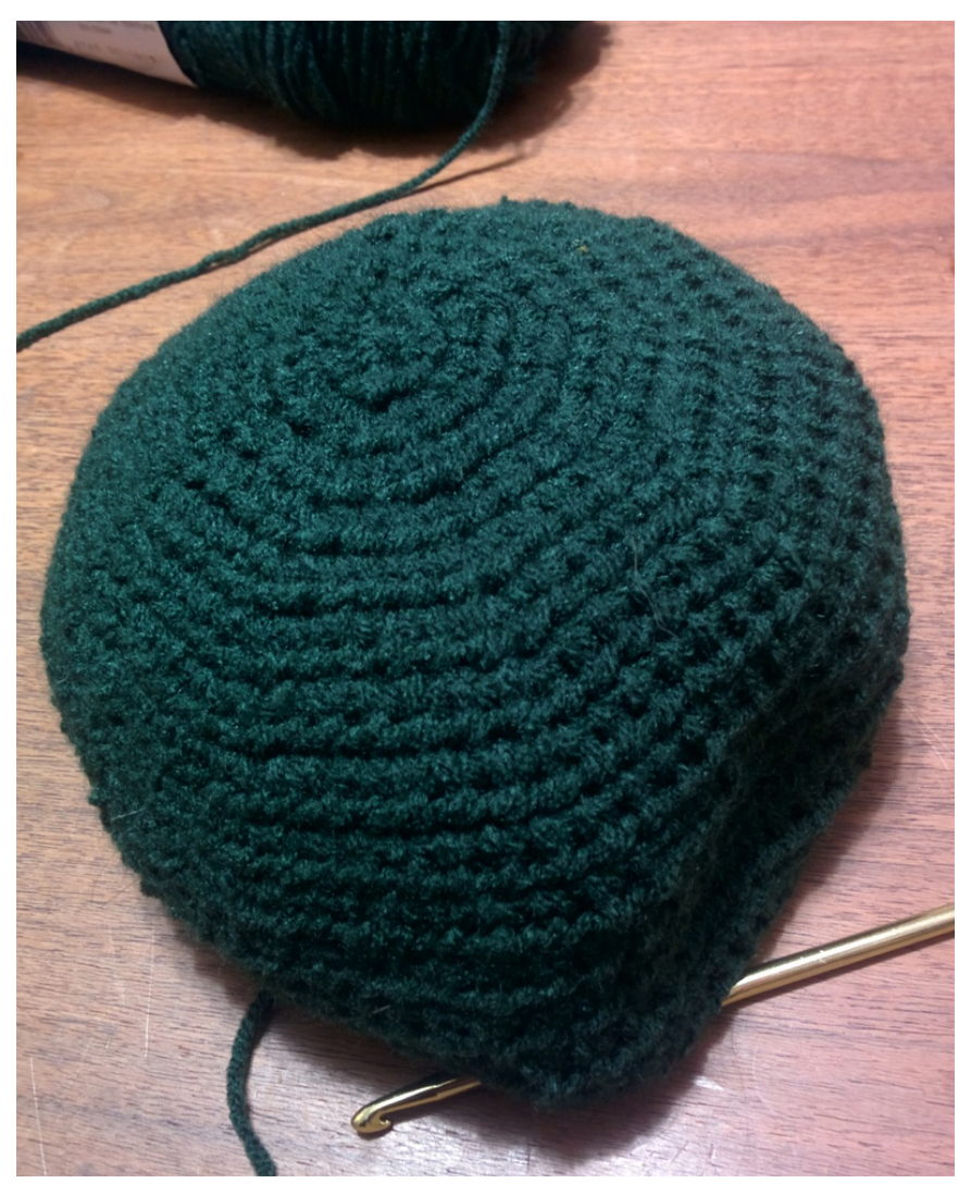
Figure 6. Making progress